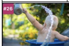
#26 Splish, Splash, Splish Children love to play with water, inside and outside, splashing, pouring...

different fruity, herbal and spicy tea bags, and citrus fruits to the water with teapots and cups. At home try Tiny Happy People's Painting with tea bags and talk about the smells and patterns; visit https://www.bbc.co.uk/tiny-happy-people/painting-with-teabags/zm7t6v4