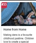
#33 Home from Home Making dens is a favourite childhood pastime. Children love to create a special

In red room last week the children have been playing in dens and putting toys in boxes as part of the enveloping and enclosing schemas. This week outside the children will be making dens and indoors they will be wrapping boxes and toys in paper which will also help to develop their scissor skills. Try making some dens at home. Visit 50 Things to do Before You're 5