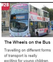
The Wheels on the Bus Travelling on different forms of transport is really exciting for young children.

The last week before the holidays the children in red and purple rooms noticed the roadworks before our new zebra crossing is installed outside school. They noticed the traffic lights and vehicles that had stopped on the roads. So this week the children will be using a traffic light and zebra crossing role play with different vehicles each day. Travelling on different forms of transport is really exciting for young children, riding on the top deck of a bus or catching a train or even a steam train from Keighley. See 50 Things To Do Before You're Five #28 The Wheels on the Bus Download the app at https://bradford.50thingstodo.org/app/os#