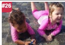
#26 Splish, Splash, Splosh

In yellow , green and blue rooms last week due to the warm weather the children have had lots of opportunities to play with water such as using spray bottles to keep cool and playing in the water tray, filling and emptying containers. This week the children will deepen their knowledge by exploring moving water with resources such as pipes, tubes and hose pipes. To find out more see 50 Things To Do Before You're 5 #26 Splish, Splash, Splosh .