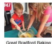
Great Bradford Baking

Download the app at https://bradford.50thingstodo.org/app/os#