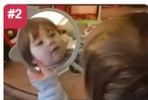
Where Am I?

In red and purple rooms, we will be welcoming new and existing children to school and children will continue to settle into our nursery play and routines, learning where their coat peg is, where to go to the toilet or have nappies changed, wash and dry hands and how to use all our wonderful play resources. At home to help children make sense of themselves and their family talking together helps children to be self-aware, develop language and feel safe.